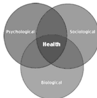
Figure 2 The Venn diagram of the Biopsychosocial model.

More recently the concept of the bio-psycho-social model of health has been adopted. The component parts are defined as adjectives rather than as the nouns, and these are illustrated by way of interlocking circles where the inter-connected biological, psychological and sociological aspects contribute equally to health.